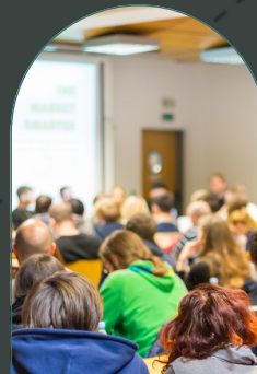
Industry Focused Seminars + Sustainability Focused Workshops