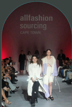
Young Designers Competition