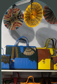
Special Product Showcases