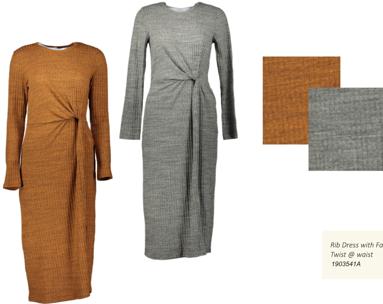
Rib Dress with Fashion Detail Twist @ waist 1903541A

The work contained in this document is an original creation of Compagnie Mauricienne de Textile Ltée (CMT). As the author of the said work and owner of the copyright in respect of that work, CMT holds all economic, moral and intellectual property rights throughout the world in respect of that work and of any derivative work created therefrom. The use, copying, printing, tracing, drawing, reproduction, adaptation, alteration, arrangement, application, displaying, communication, exploitation, transmission and/or publication of the said work and of any derivative work created therefrom is strictly prohibited and punishable by law. The communication by CMT of the present document shall under no circumstances be construed, interpreted or otherwise regarded as conferring upon or transferring to the recipient thereof the economic rights in connection with the work contained in this document.