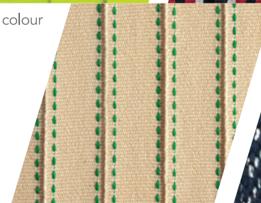
▲ Saddle Stitch