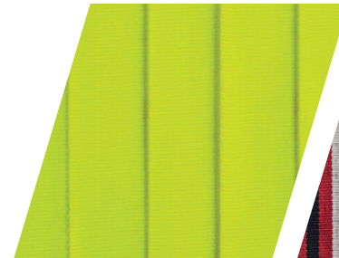
▲ Whole colour