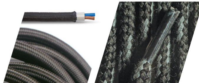
▲ Speciality Products