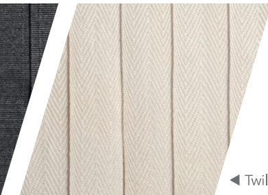
◀ Twill (Herringbone)