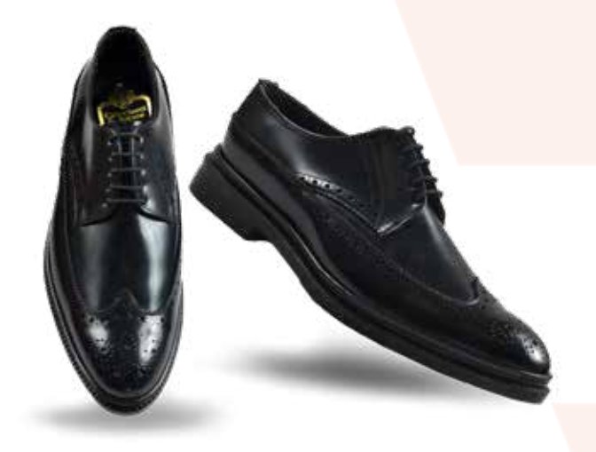
COMFORT UNIT SOLE