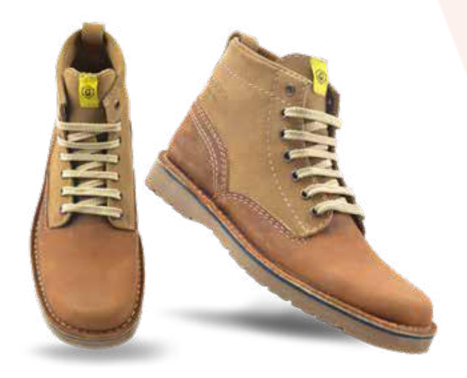
STITCH DOWN BOOT