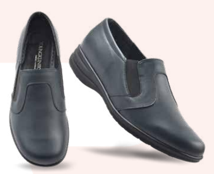
COMFORT SLIP ON