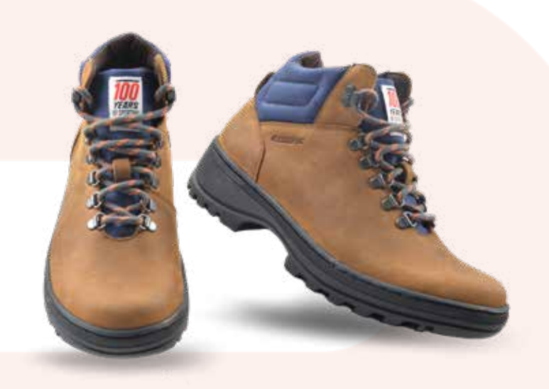
LEATHER MID HIKER