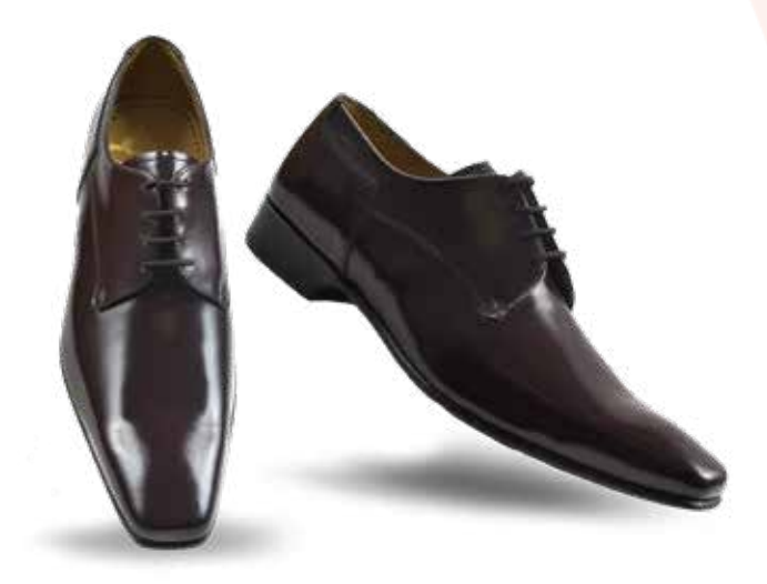
CEMENTED PLAIN VAMP