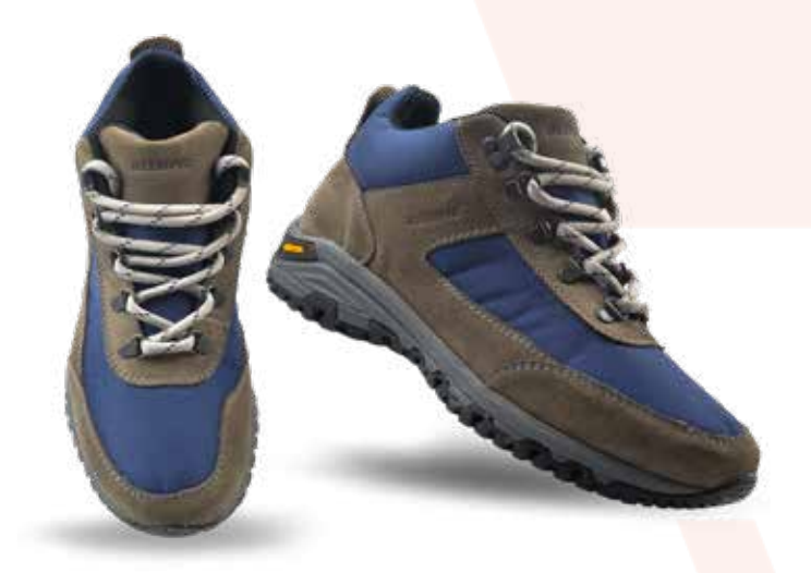
SUEDE /PU MESH HIKER